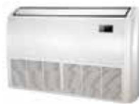
Floor ceiling 18/24